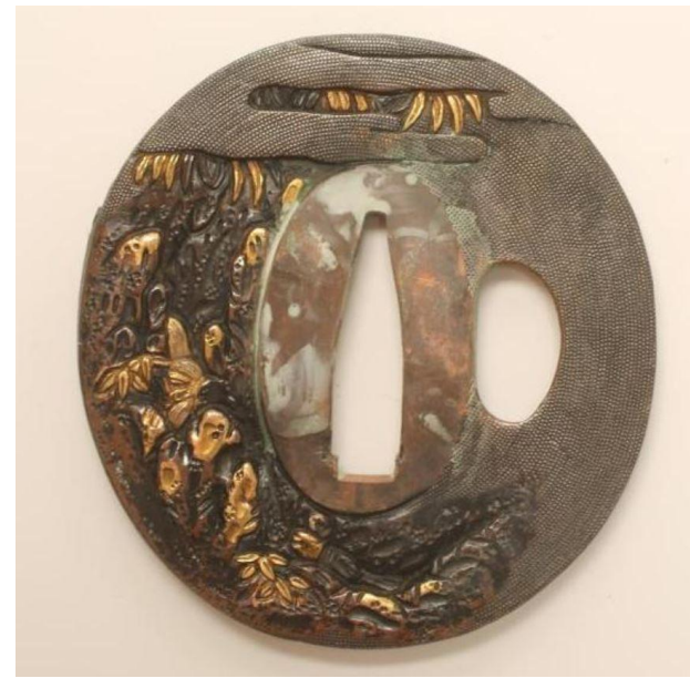
Bronze tsuba – no signature