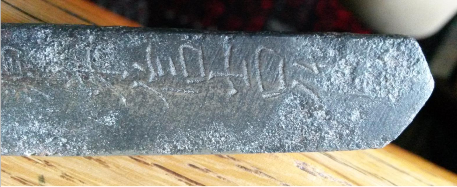
File marks slightly slanting left (kosuji-chigai or katte-sagari)